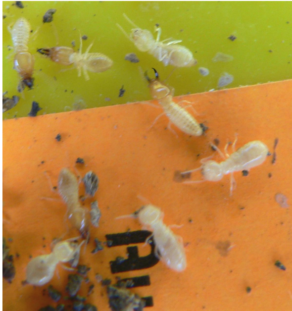
Workers and soldiers – Coptotermes.