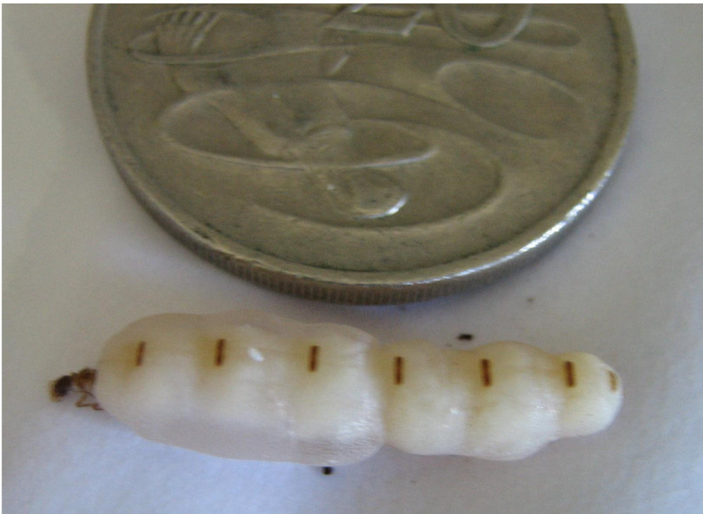
You won't find or see this girl too often – she's the Queen.