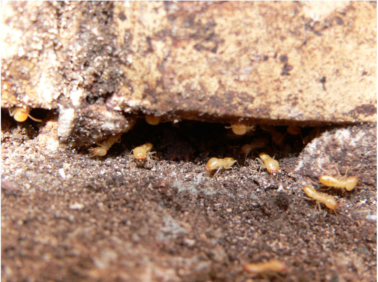
Schedorhinotermes soldiers in a gap between two bricks on the outside wall of a brick clad timber frame home. This entry point was located 30cm below ground level.

Quick tip: If you find termites and want to have them identified, collect a few soldiers and send them to Green Termite Bait Systems. Just catch them with a bit of sticky tape then stick them to a piece of paper with your name address and phone number.