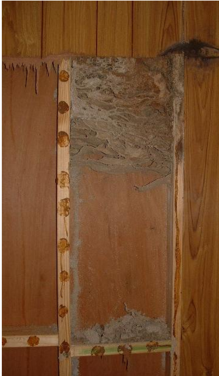
This nest was inactive at the time of discovery.

It was one of two sub-nests in this particular house. The other sub-nest had been treated several months earlier and it is considered that the treatment at the time also carried across to this as yet undetected termite nest.