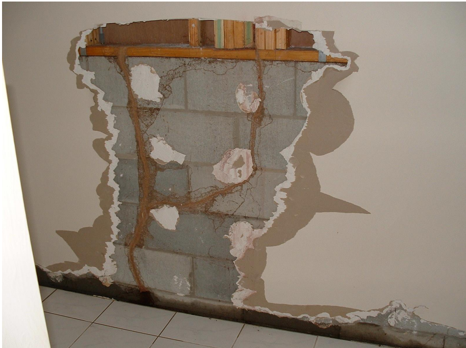
The owner of this home ripped open this wall (wrong thing to do!) after finding termites in the skirting board. The plaster covering the termite leads had been soft to the touch.

Another thing you are listening for when you are tapping is the sound of termites chattering back to you. Not all termite species chatter when they are disturbed but some do. If you tap on an area of termite activity and the termites are disturbed, they might warn each other by vibrating their bodies against the timber. The sound is faintly audible if you listen carefully and the room is quiet. It's about the same audio level as that of a bowl of rice bubbles popping after the milk's been added. Describing the sound is difficult, however if you can imagine that it sounds like the faint crinkling of cellophane, you're close.