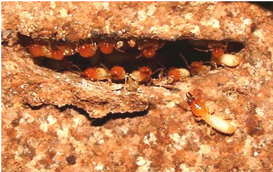
A group of Coptotermes soldiers vigilantly defending their entry point in a besser block wall after the plaster was removed to expose them.