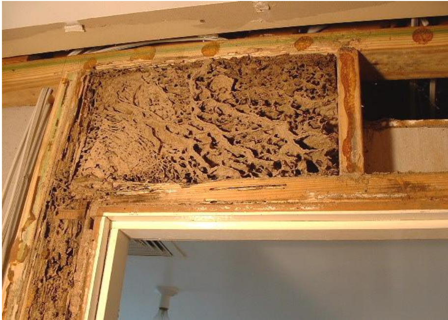
This picture shows the original nest that was treated in an adjacent bathroom.